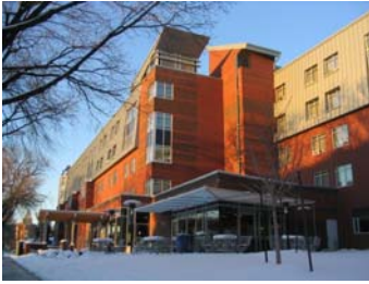
Alumni Hall & Conference Centre