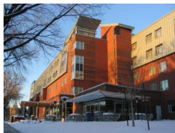
Alumni Hall & Conference Centre

Please note that accommodation reservations and costs are the responsibility of the athlete. Alumni Hall is located approximately 400m from the stadium. Parking is included with your room.